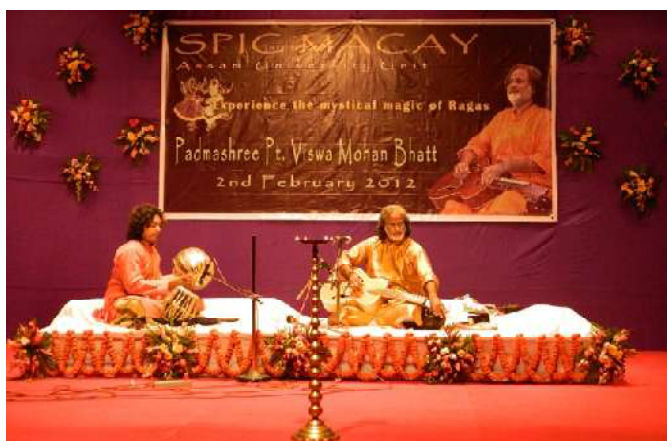
Padmashree Pt. Viswa Mohan Bhatt playing Mohan Bina at Bipin Chandra Pal Milanayatan.

to the students' interests and contributes towards the promotion of students' extra-curricular activities. The Students' Council also organises a week-long social meet every year. During these seven days, the students display their creative talents in the field of sports and other cultural activities.