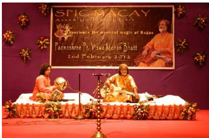
Padmashree Pt. Viswa Mohan Bhatt playing Mohan Bina at Bipin Chandra Pal Milanayatan.

to the students' interests and contributes towards the promotion of students' extra-curricular activities. The Students' Council also organises a week-long social meet every year. During these seven days, the students display their creative talents in the field of sports and other cultural activities.