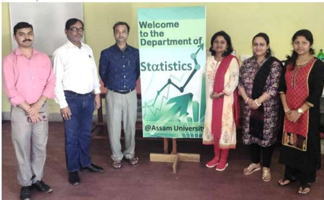
Faculty and Non-Faculty Members of Department of Statistics, Assam University.

ENTRANCE EXAMINATION: 50 Multiple Choice Type Questions (all compulsory) on Algebra (Matrices, Binomial Theorem, Infinite series, Permutation Combination, Set Theory), Probability, Probability Distributions (Bernoulli, Binomial, Poisson, Normal, Gamma, Exponential, Beta) and Descriptive Statistics shall comprise the written test. The written test may be followed by personal interaction, which may be conducted online.