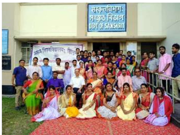
Cultural Programme on Sanskrit Day Celebration 2019

Placement : A good number of passed out students have been serving as faculty members in the colleges, University and other Educational Institutions.