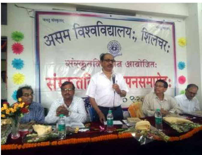
Sanskrit Day Celebration 2019