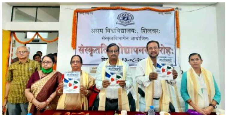
Release of the Departmental Research Journal Vagisvari 2022