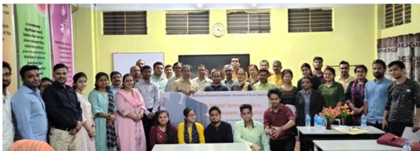
Group Photo following the Valedictory Session of the National Workshop on Dimensions of Socio-economic Deprivation conducted by the Department in March, 2022.

SYLLABUS FOR ENTRANCE EXAMINATION: Probability, Probability Distributions, Research Methods and Statistical Methods. Question pattern shall be of both subjective and objective type.