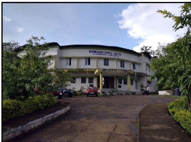
Administrative office at Diphu

Academic and Administrative activities for the Diphu Campus is at present being carried out in a temporary accommodation as the construction of the appropriate infrastructure in the permanent campus site is in progress. Arrangement of Hostel accommodation for students is in the process.