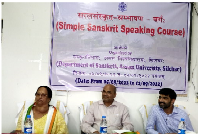
Simple Sanskrit Speaking Course Inaugural Session 2022