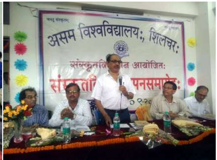
Sanskrit Day Celebration 2019