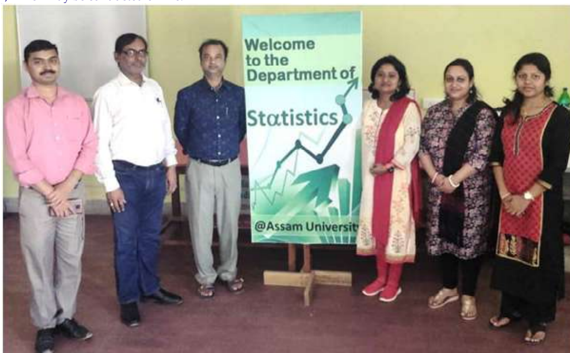
Faculty and Non-Faculty Members of Department of Statistics, Assam University.

ENTRANCE EXAMINATION: 50 Multiple Choice Type Questions (all compulsory) on Algebra (Matrices, Binomial Theorem, Infinite series, Permutation Combination, Set Theory), Probability, Probability Distributions (Bernoulli, Binomial, Poisson, Normal, Gamma, Exponential, Beta) and Descriptive Statistics shall comprise the written test. The written test may be followed by personal interaction, which may be conducted online.