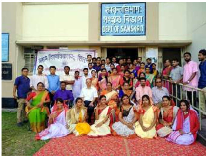
Cultural Programme on Sanskrit Day Celebration 2019

Placement : A good number of passed out students have been serving as faculty members in the colleges, University and other Educational Institutions.